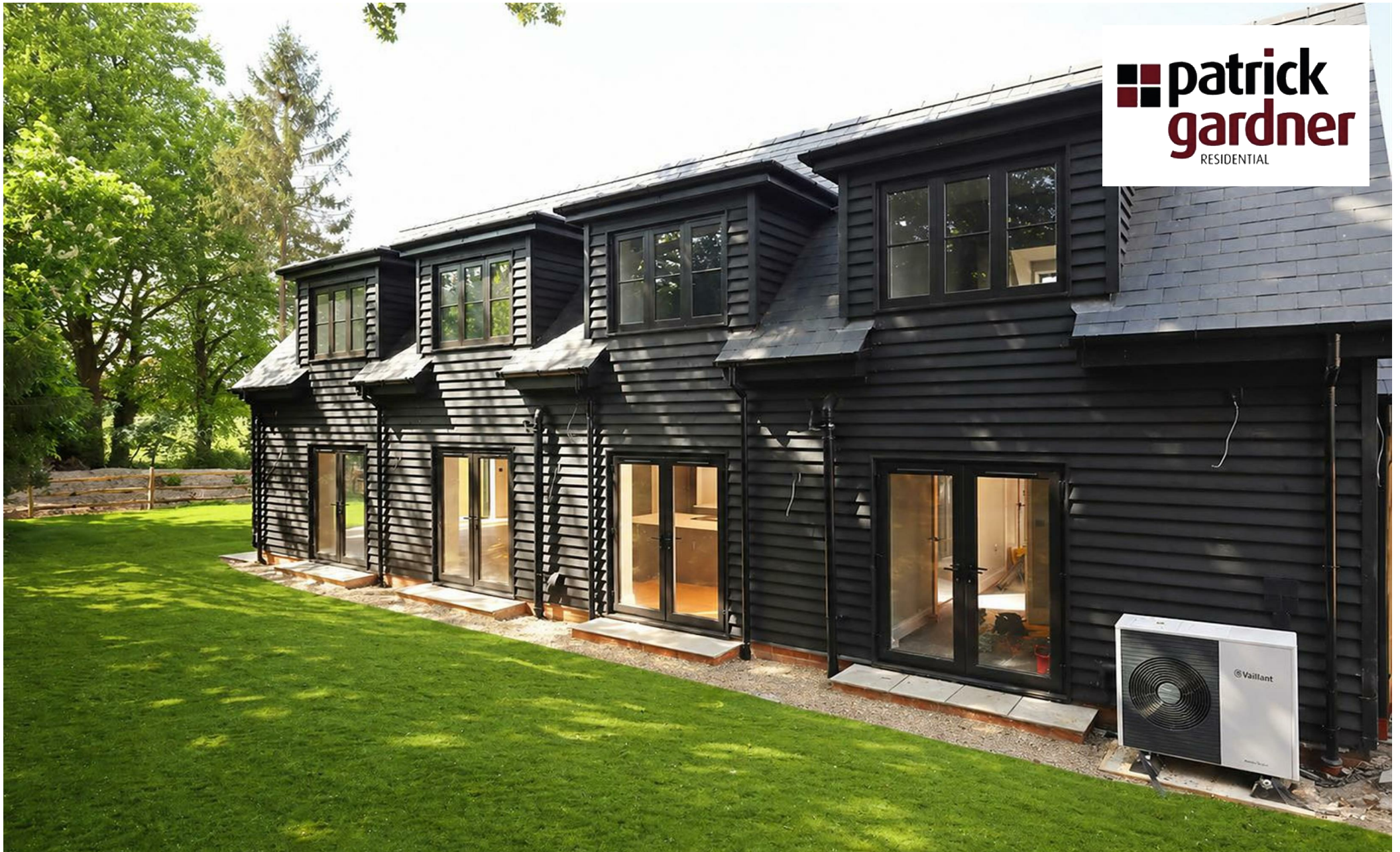
Grove Barn, 10 Paddock Grove, Effingham, KT24 5BF